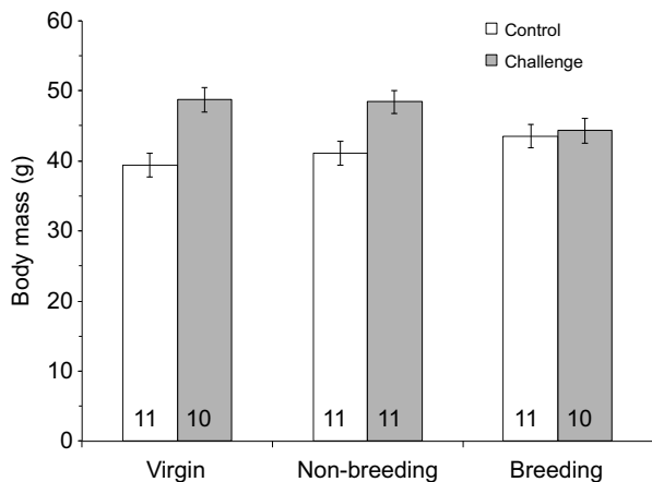
Fig. 2. Estimated marginal means and standard errors of postpartum body mass, adjusted for age, in adult male California mice ( Peromyscus californicus ). ANCOVA revealed an interaction between housing and reproductive conditions ( P=0.037 ) and a main effect of housing condition ( P<0.001 ). Sample sizes are shown within the bars.

No significant effects were found for absolute lean mass. When expressed as a percentage of total body mass, however, per cent lean mass was significantly lower in Chal compared with Ctrl